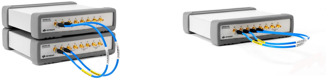
Figure 7: Short matched SMA cable pair for cascading ISI channels from two units or within one unit.