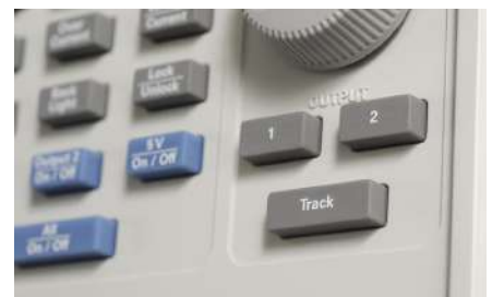
Figure 3. Simplifies Output 1 and Output 2 setup with tracking feature