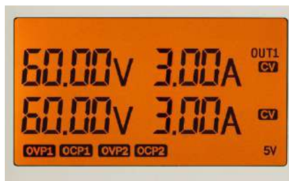
Figure 2. Backlight on/off feature with dual reading (voltage and current) on an LCD display