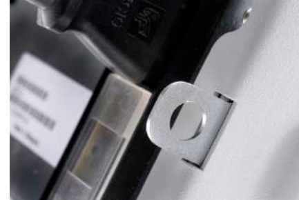
Physical lock mechanism as illustrated

Essential security features: Over-voltage protection (OVP)/ Over-current protection (OCP), keypad lock and physical lock mechanism