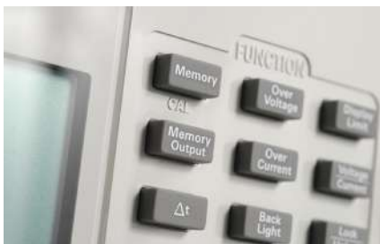
Figure 1. Output sequencing made easy with intuitive keypads

Both models of the U8030 series come with a set of features to suit your needs while remaining easy to use. The LCD screen displays both voltage and current readings in a one-view panel while the all ON/OFF button allows multiple outputs to be controlled simultaneously. Additionally, the auto-track feature simplifies setup between output 1 and output 2. With these, you get a solid bench power supply plus a set of convenient and easy to use features.