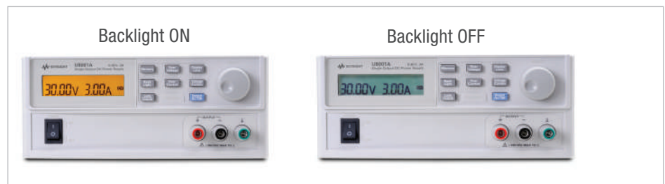
Figure 2. Backlight on/off options for LCD display