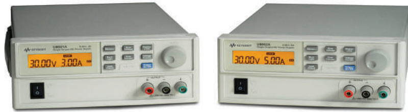
Figure 1. The U8001A 90 W and U8002A 150 W single output DC power supplies