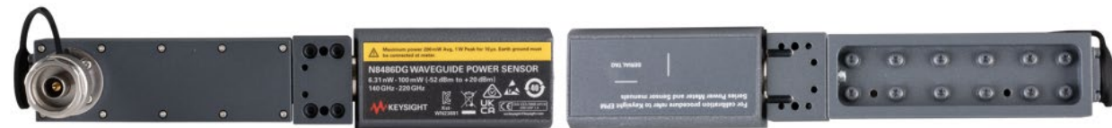
Figure 8. N8486DG-200 comes with built-in EEPROM to store calibration factors with extended dynamic range of -52 to +5 dBm.