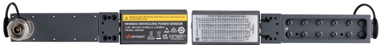
Figure 7. N8486DG-100 comes without built-in EEPROM with a dynamic range of -30 to +20 dBm. Users need to pre-enter calibration factors printed on the back of the sensor into the power meter.