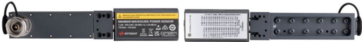
Figure 5. N8486DD-100 comes without built-in EEPROM with a dynamic range of -30 to +20 dBm. Users need to pre-enter calibration factors printed on the back of the sensor into the power meter.

Enable precise high-frequency source power calibration with the N8486DD and N8486DG, supporting the rapidly evolving 6G industry, particularly in R&D design validation and manufacturing. Designed with a WR-6 flange connector for the N8486DD and a WR-5 flange connector for the N8486DG, these sensors allow for accurate and direct waveguide measurements in the D/G-band frequency range and are compatible with Keysight EPM power meters (N1913/14B and N1913/14A). With a wide dynamic range of -52 up to +10 dBm and a built-in EEPROM to store calibration factors, Option 200 ensures the precision and accuracy you need in a single power sensor.