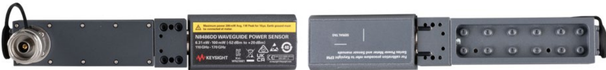
Figure 6. N8486DD-200 comes with built-in EEPROM to store calibration factors with extended dynamic range of -52 to +10 dBm.